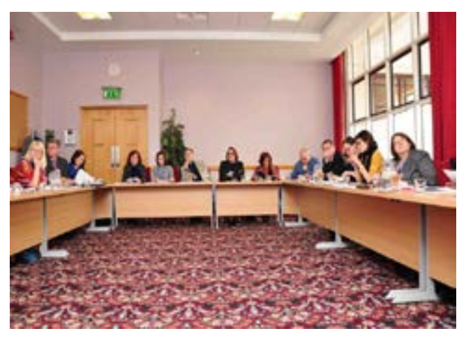
EQAVET Members discussing at the working groups

The cooperation with the higher education is important for the realisation of permeability – reciprocal recognition of qualifications. There is a need to create cooperation programmes between VET providers, universities and companies. VET and higher education have different models of governance. The involvement of the social partners can alleviate these differences; therefore initiatives should be put in place to involve them in the cooperation strategies.