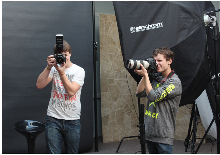
Study visit to College of Automation and IT #20 during UNEVOC regional forum in Moscow: Photography students

Held over two weeks, these virtual events are a way of raising awareness on important issues and launching new debates. "They help us to capture the wealth of knowledge and expertise of UNEVOC Network members more systematically, to synthesize it and draw conclusions we can refer back to," says Shyamal Majumdar, Head of UNESCO-UNEVOC.