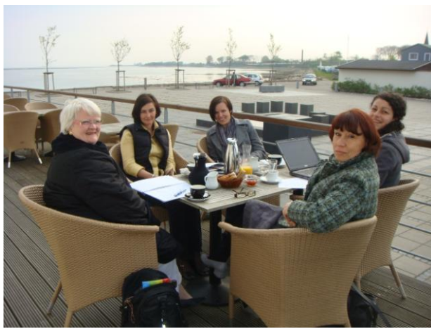
BAEA project team meeting

different fields of expertise in adult education and conducting a range of activities (from desk research to handbook development, receiving feedback from all the actors involved along the process) the project team aimed to provide a full picture of the situation for initial education and training for adult educators-to-be as well as materials that can be used by researchers, policy-makers and practitioners.