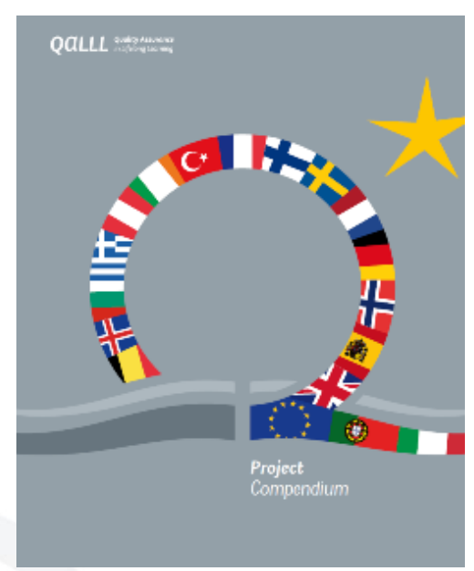
QALLL project compendium

The quotation by Benjamin Franklin heading this text seems to have been the maxim of the 39 QALLL good practice projects that have been selected in the framework of our thematic network. You can find all of them in the