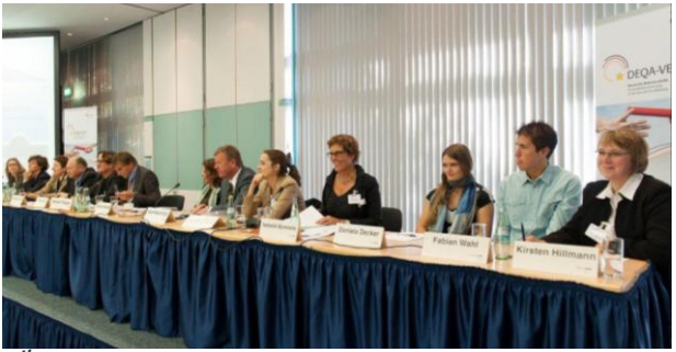
4th DEQA-VET Symposium

More than 150 national and international experts came together in Bonn on September 13<sup>th</sup>/14<sup>th</sup>, 2012 in order to discuss the current situation of quality assurance in the different education fields in Germany.