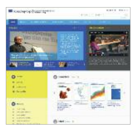
Sneak preview: the website's new home page will look something like this!