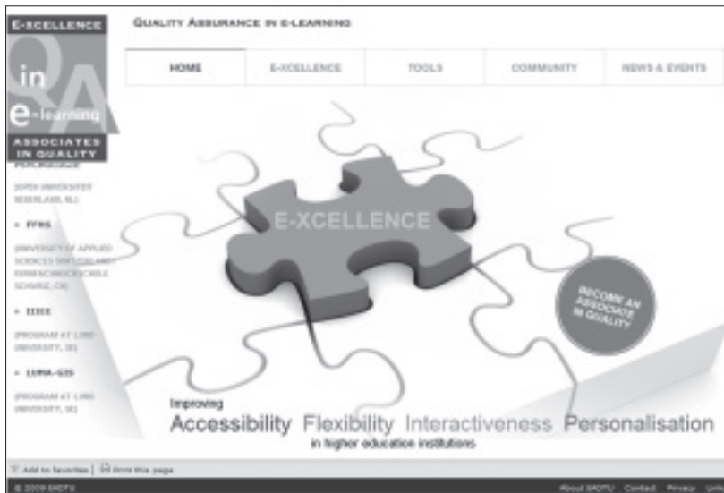
Figure 2. Universities and University Programmes that were awarded the E-xcellence Associates label belong to the EADTU Associates in Quality.

Unlike EADTU's E-xcellence+ , the ELBE benchmarking operates more on a collaborative basis. It has co-operated, however, with the former, and EADTU's Quick Scan was used as a starting point for the ESMU exercise with the participation of nine European universities. The benchmarking criteria were based on the six areas