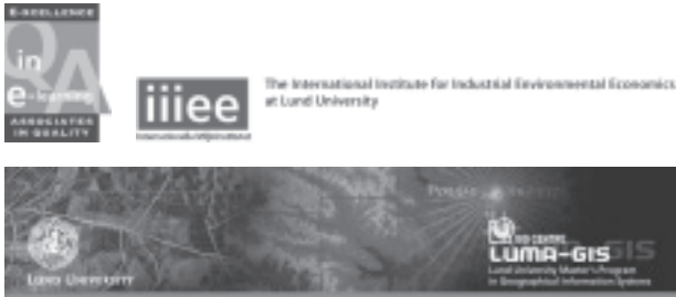
Figure 1. The EADTU E-xcellence Associates' label to LUMA-GIS and IIIEE at Lund University, Sweden.

The E-xcellence Associates focus on the improvement of four primary elements of progressive higher education: accessibility , flexibility , interactiveness and personalisation (Figure 2), (EADTU, 2008). All these fundamental success factors were reached to a high extent in the benchmarking. The label led to recognition, not only locally at the university, but also regionally, nationally and internationally with several benefits for students, such as reception of grants, international co-operation and networking. Responsible staff for the LUMA-GIS was awarded the Lund University pedagogical prize of 2009 for their innovative and good quality work, and contribution to internationalisation within the LUMA-GIS programme, as shown below.